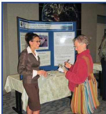
The Navy will continue as a community partner and strives to balance the Navy's mission at Naval Base Kitsap-Bangor with environmental and community interests.